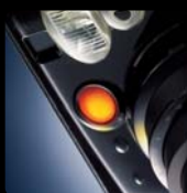
Orange lamp will appear when Self Timer is activated.

Self-Timer mode allows you to create two photos with the single press of the shutter. Enjoy instant photos with friends or that special person in your life.